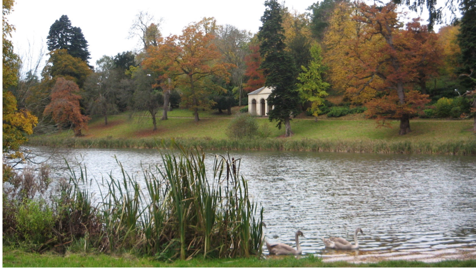
Serving the same purpose as the old Castle 'keep', the temple acts as an picturesque eye-catcher.