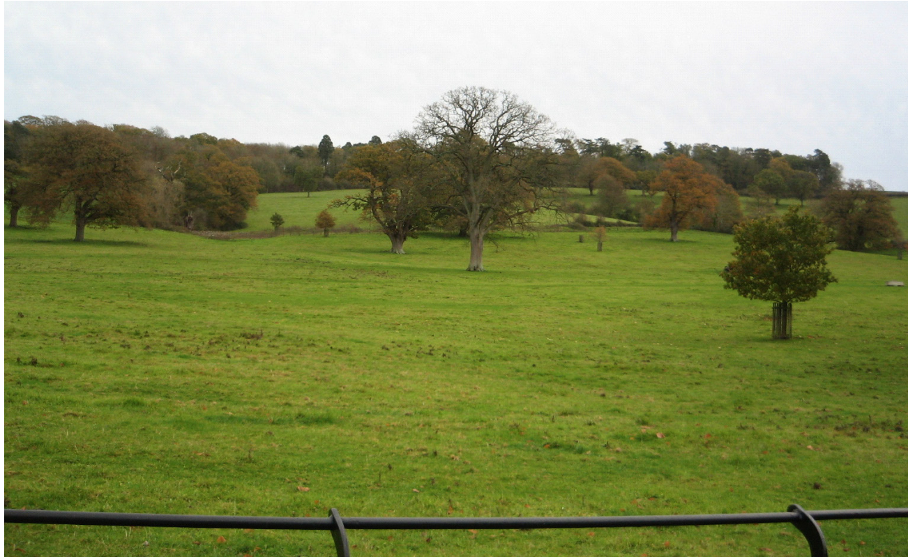
The Park, Newton Park. Lime trees and mature oaks from the 1760s form part of today's landscape