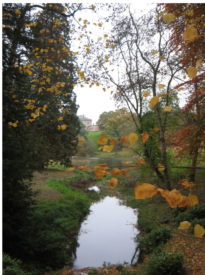
The new house overlooking the lakes; serpentine lines and water were essential elements of the Brown landscape.