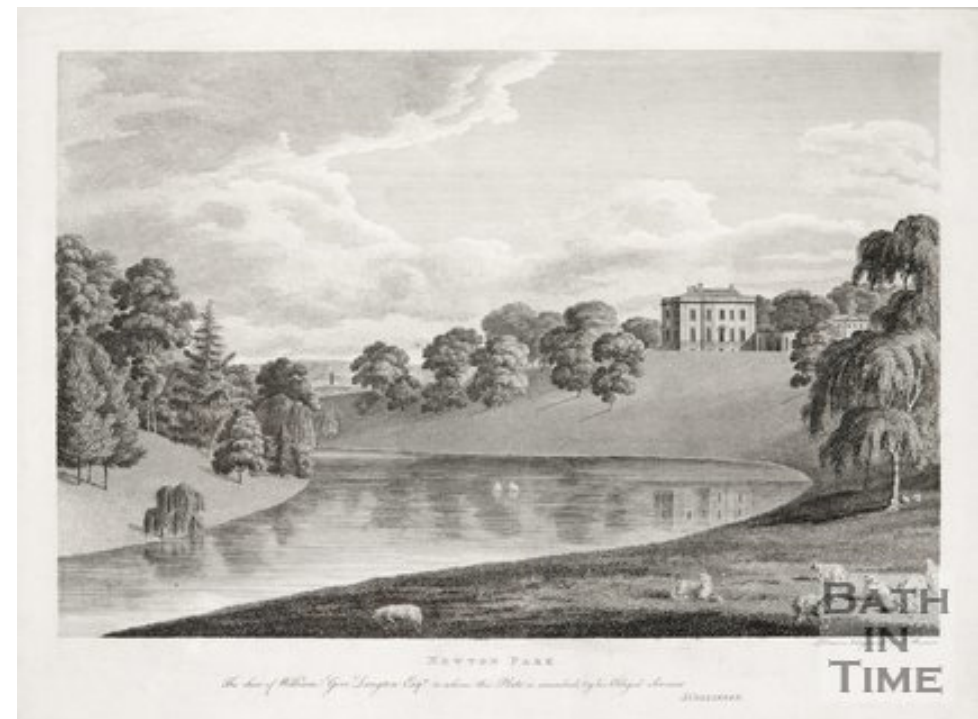
Newton Park, 1791, Published in Collinson's History of Somerset 1791