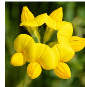
Bird's-foot trefoil

Newbridge Slopes is managed by Avon Wildlife Trust and is a wonderful mix of limestone grassland and woodland. In the meadows you can find wildflowers such as salad burnet, yarrow, woolly thistle and bird's-foot trefoil.