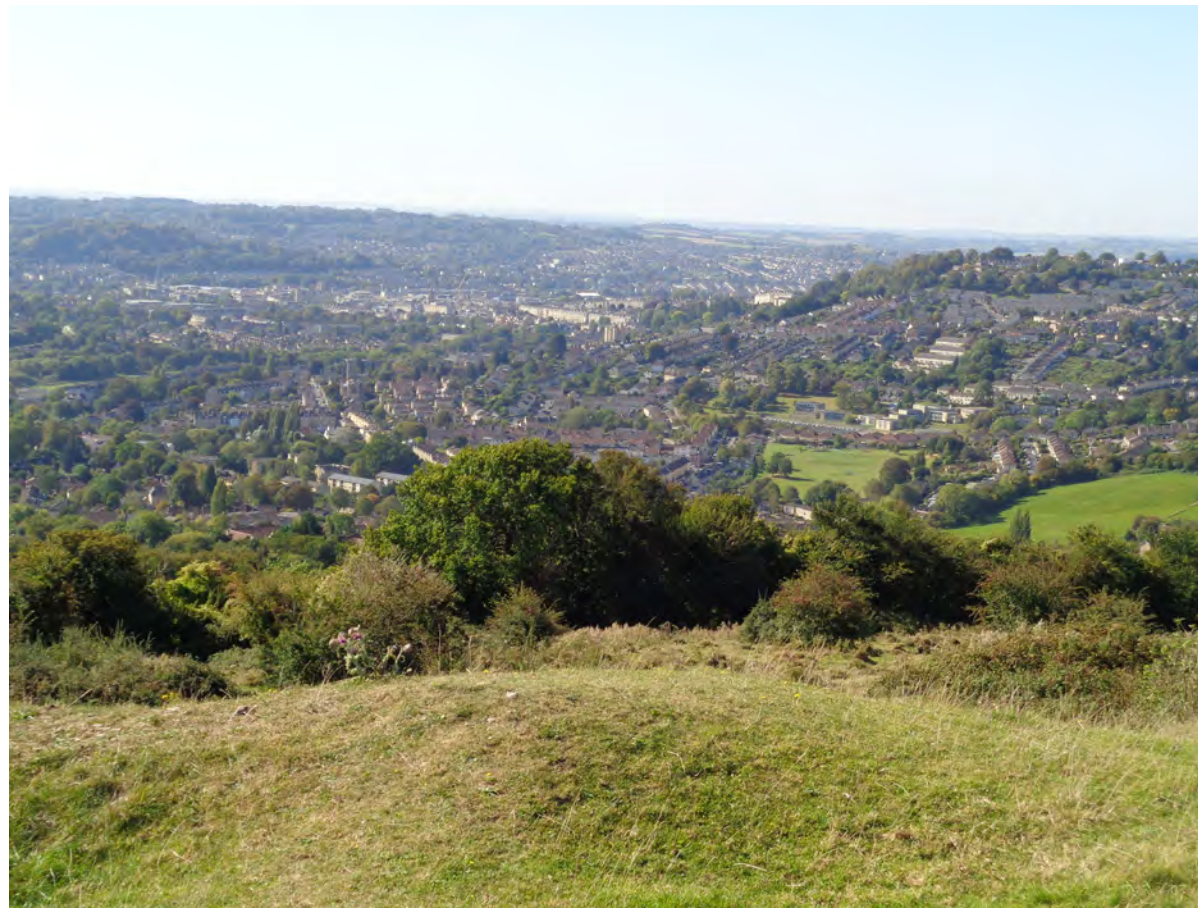
View from Little Solsbury Hill over Bath.