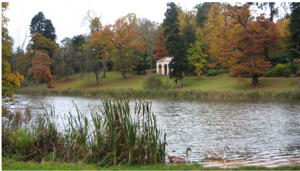
Serving the same purpose as the old Castle 'keep', the temple acts as an picturesque eye-catcher.