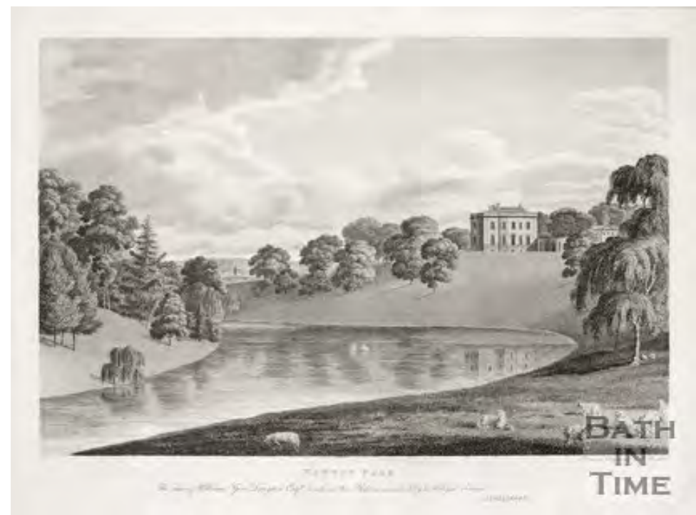
Newton Park, 1791, Published in Collinson's History of Somerset 1791