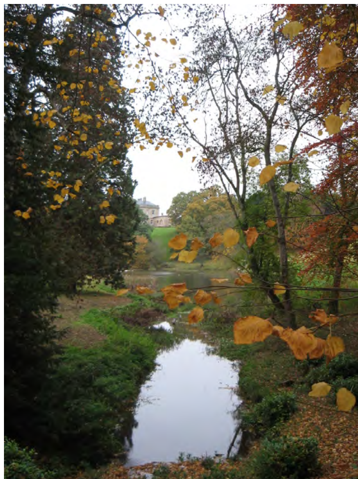
The new house overlooking the lakes; serpentine lines and water were essential elements of the Brown landscape.