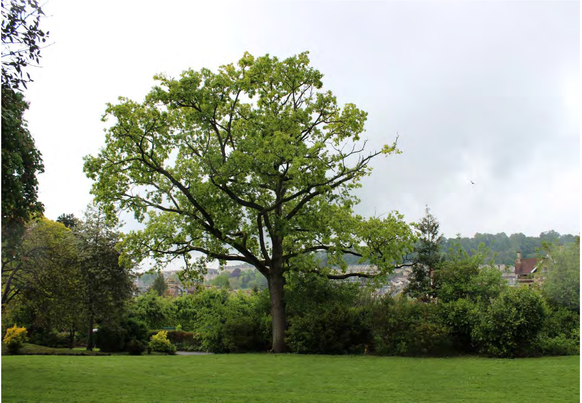
The Peace Oak