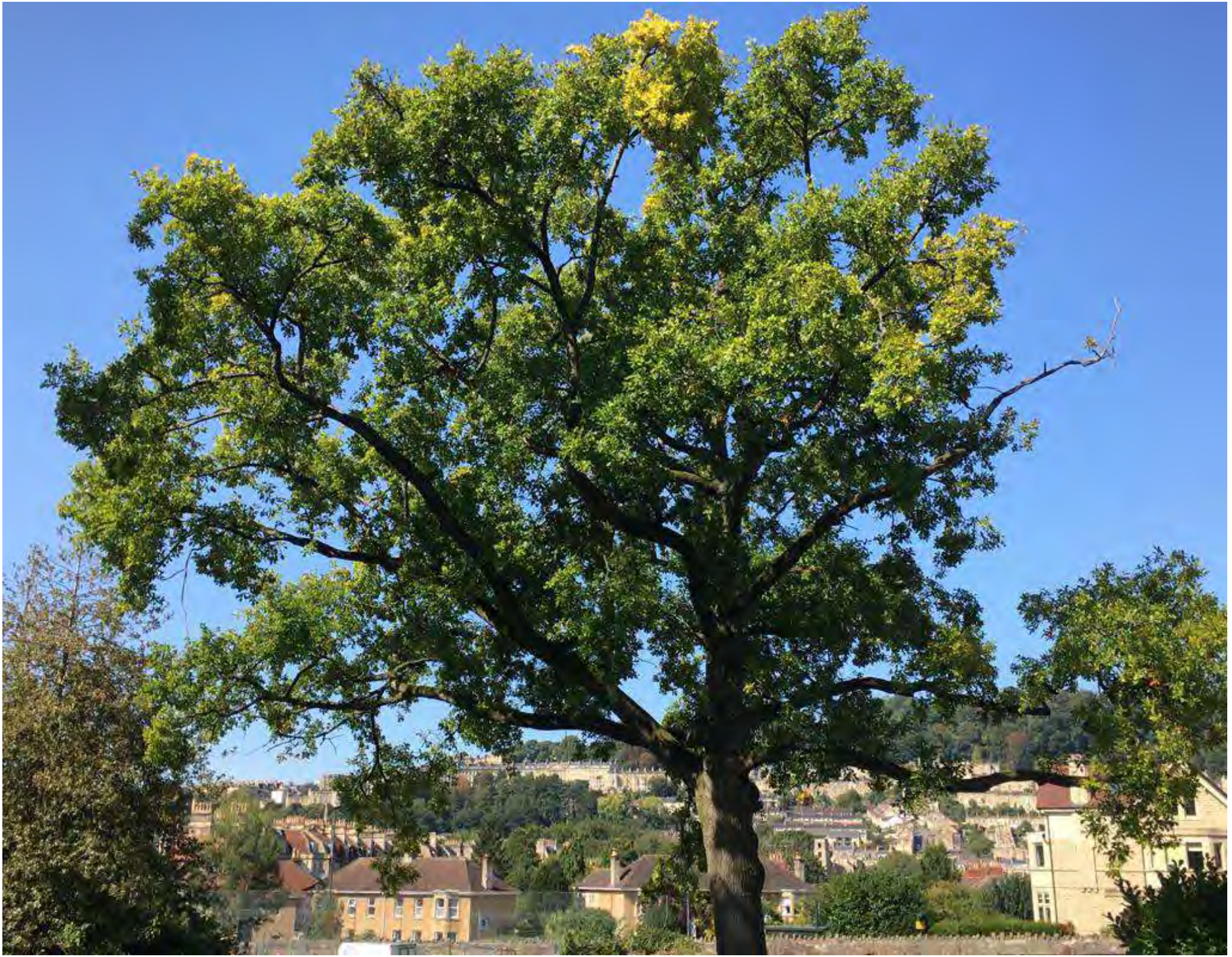
The Peace Oak