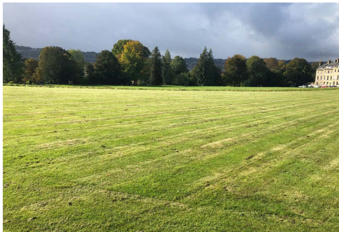
.....Now you don't Royal Crescent ha-ha from the north