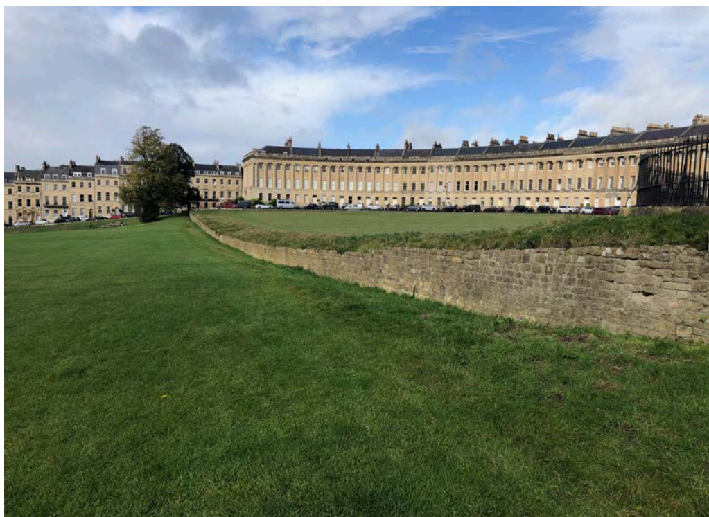
Now you see it..... Royal Crescent ha-ha from the south