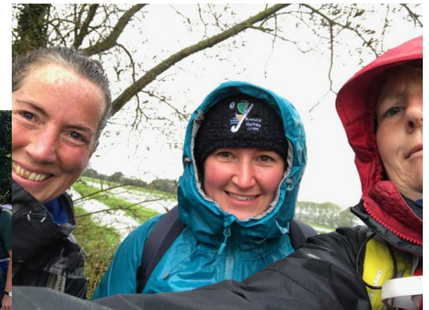
Exploring and Julian House walk - no wrong weather, just layers of clothes