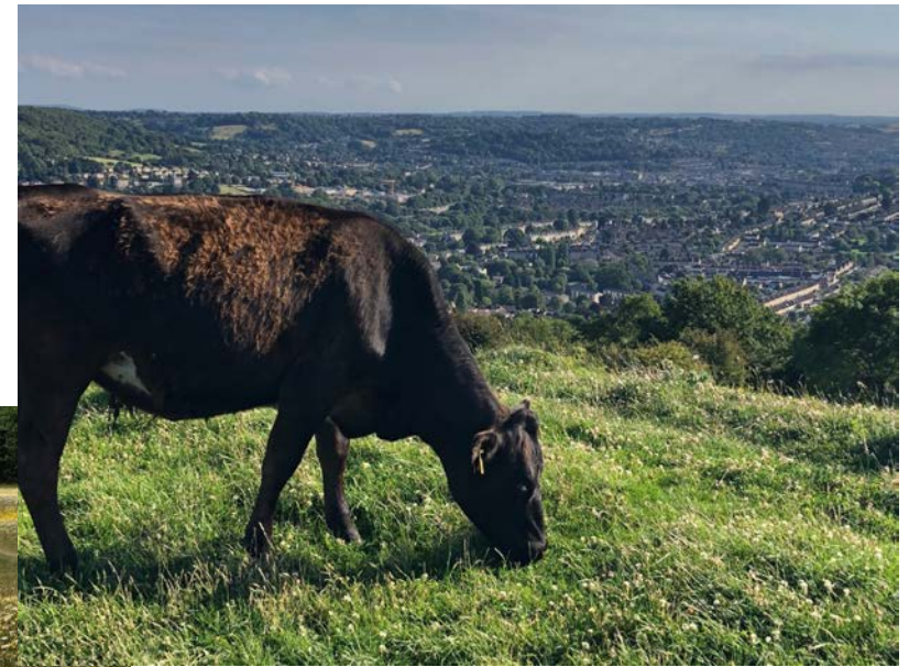
Solo walking Lockdown 1. Bee-flies, Kelston Roundhill and Solsbury Hill.