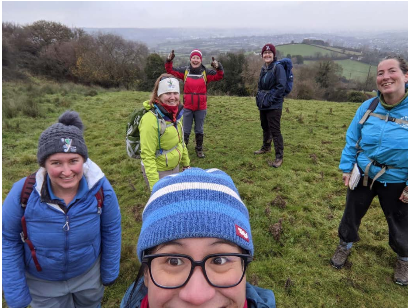
Last group walk before Lockdown 3