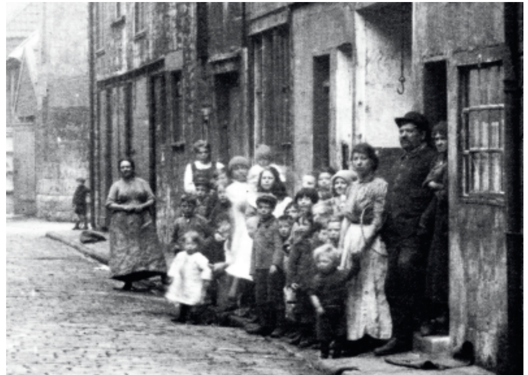
Milk Street, Bath, in Victorian times

The new Bath Union Workhouse was built between 1836 and 1838 on Frome Road at Odd Down and replaced the provision offered by 24 individual parishes. Some of the parishes were tiny, but Walcot parish was the largest civil parish in the country and in 1820 16% of its residents were receiving poor relief.