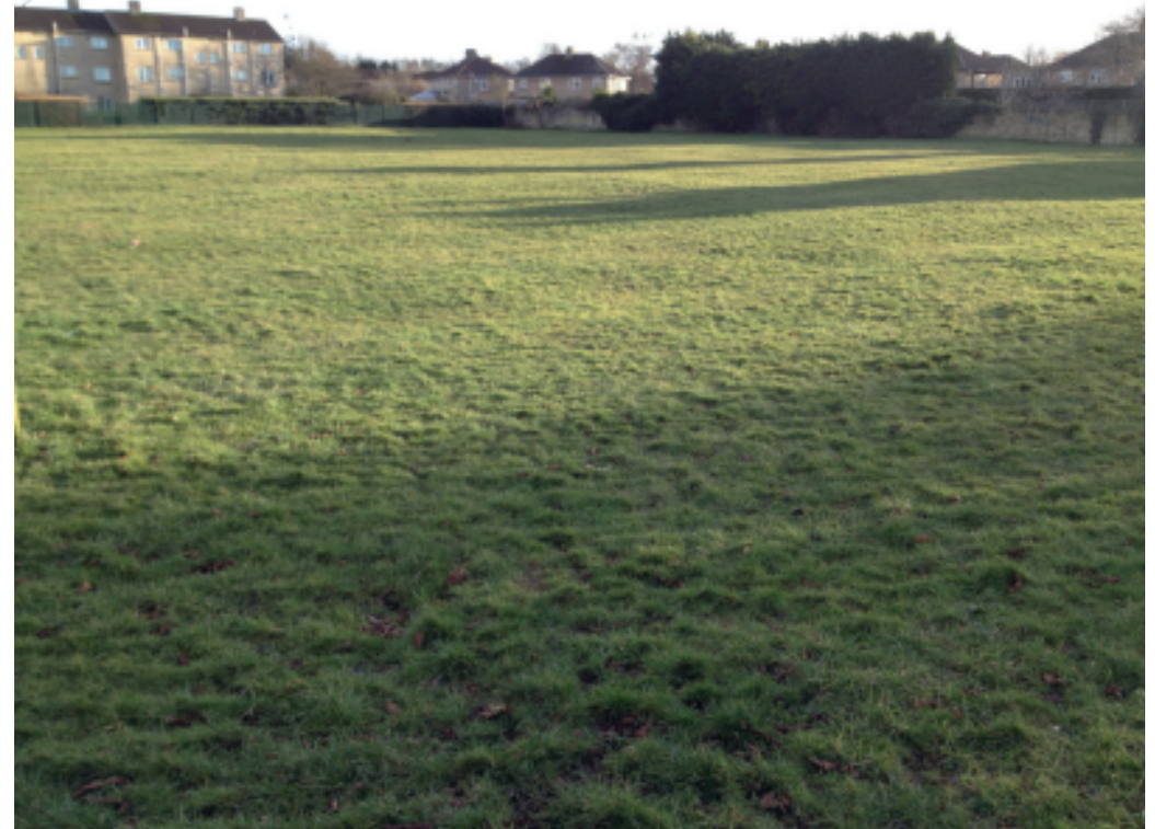
The Burial Ground

The Workhouse Burial Ground is now open space in the care of the Parks Department at Bath and North East Somerset Council. It is still consecrated ground.